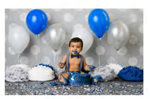
Cake Smash/ A cake smash session captures the moment your child dives face first into frosting.