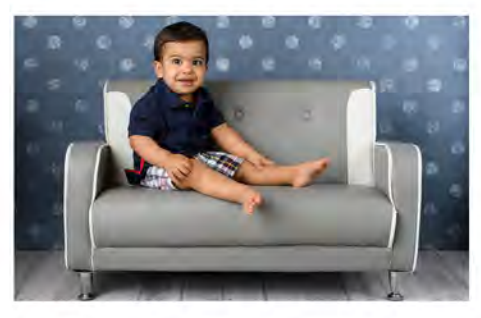
1 Year/ Celebrate turning 1. These sessions occur between 11 and 12 months old.