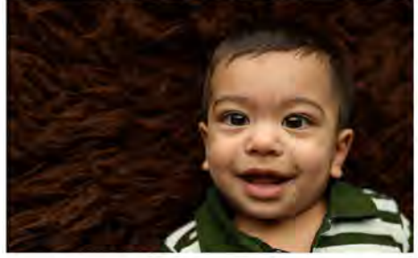
3 Months With ample head strength, belly push ups and responsive smiles this is a special time to photograph