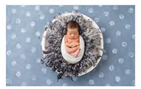
First 5-10 days is ideal. Newborns are less aware and easier to pose before the 2 week mark.

Consultation session to discuss the details of the club and yearlong photography experience Newborn Session (5-10 days) 2 hour session Tummy Time Session (3-4 months) 15 minute session Sitter Session (6-7 months) 30 minute session Crawler Session (9-10 months) 30 minute session First Birthday Portrait Session (1 year) 1 hour session Optional Maternity Session add on Optional Cake Smash Session add on