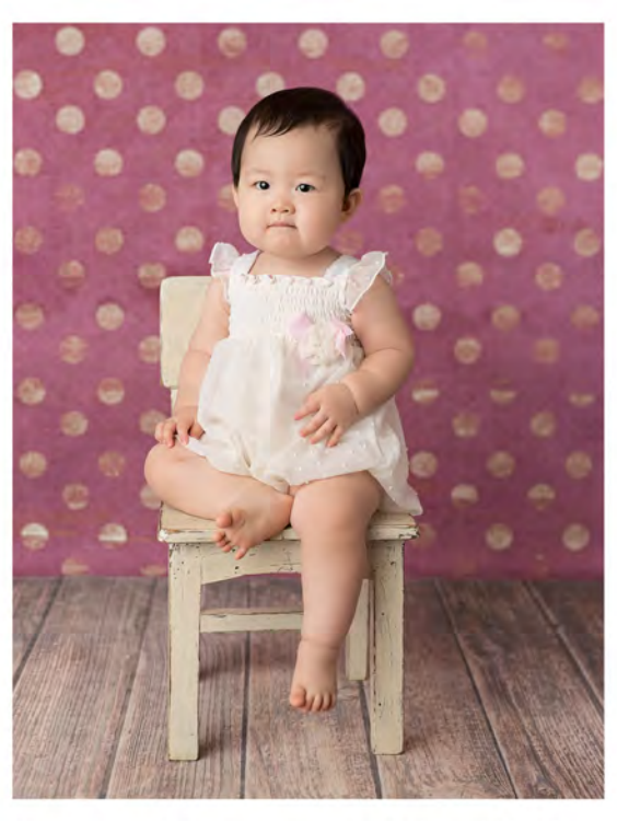
Your Life as Artwork. Timeless, Emotional, Lovely, Meaningful. These words describe how your portraits will look. Make your life into Artwork. You deserve beautiful and timeless images and a customized experience that lets you choose how you want them to be displayed. To ensure we create beautiful portraits, we will plan your session together with a brief meeting or phone consultation. We will share a laugh or two during your session and then meet a few weeks later at a reveal appointment. From there, you can choose your finished pieces like framed prints, canvas gallery wraps, albums, heirloom boxes or digital files to create a way to showcase your images for a litefetime.